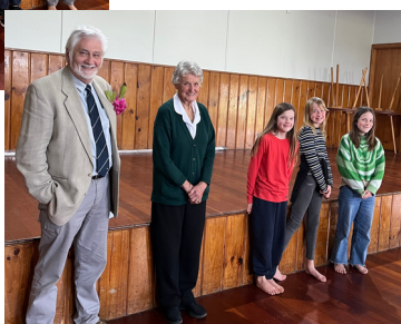
Speech winners with judges