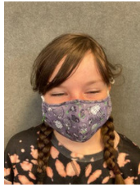
Bodhi - Billy Goats (Blue)