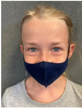
Ariana - Brainy Avocados (Green)