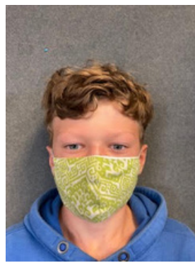
Calum - Dinosaurs (Black)