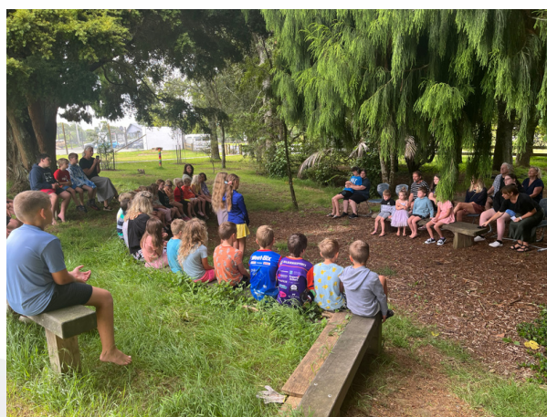
This mornings mihi whakatau