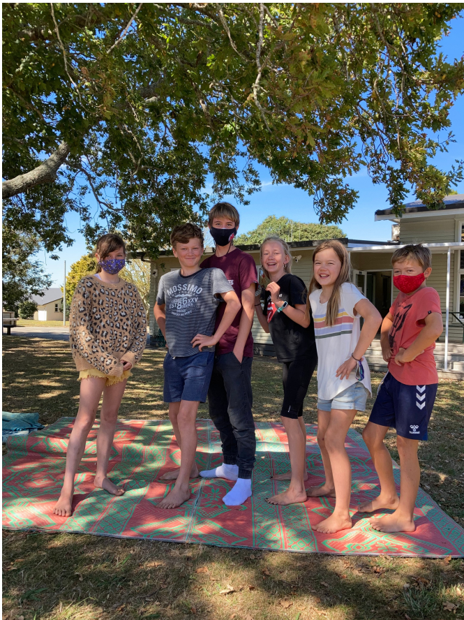
School Reps 2022