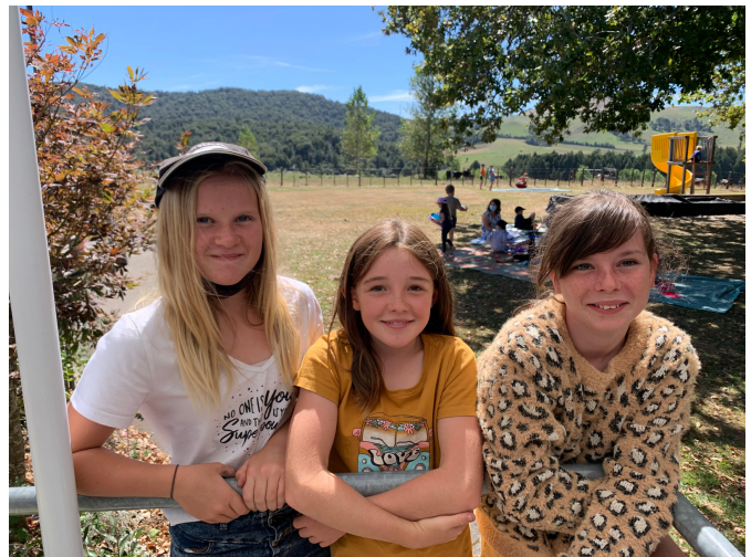
Enviro School Leaders 2022

Thank you for reading this- Enviro School Leaders.