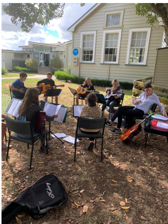
Guitar lessons under the tree

Monday 21st March Wednesday 30th March Thursday 7th April