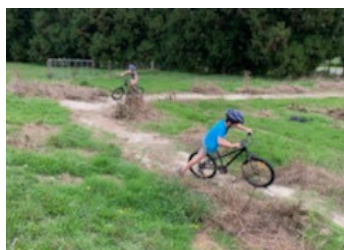
Students enjoying the bike track

AFTER SCHOOL CARE is now available. From the start of next term, families will be able to book ASC. More information will be coming on how you can book.