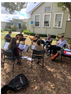
Outside guitar lessons