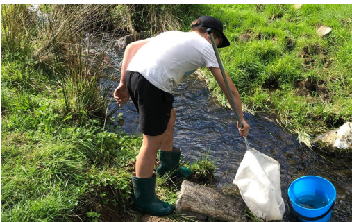
Seniors stream testing with Enviroschools